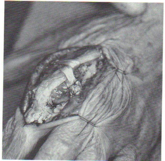
Figure 4. Intraoperative view revealing the free tendon grafts anchored securely into place with centralization of the extensor tendon.