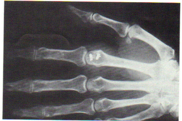
Figure 3. Postoperative anteroposterior view of the hand revealing the presence of the bone anchors in place.