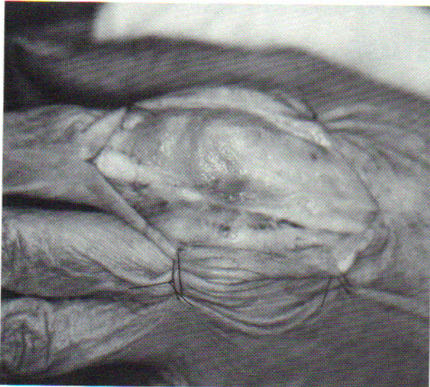
Figure 1. Ulnar subluxation of the central slip of the extensor tendon with no sagittal band fibers in evidence.