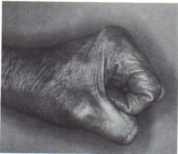
Figure 6. Eighty degrees of metacarpophalangeal joint flexion 8 months after operation.

the long extensor without tethering or subluxation. The graft was further secured by repairing the collateral ligaments.