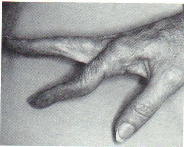
Figure 2. Preoperative extensor lag at the metacarpophalangeal joint.